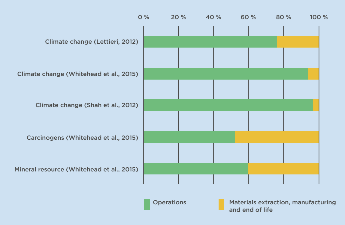
Figure 2. Life cycle contributions to selected environmental impacts associated with data centres.

Notes: Lettieri (2012)<sup>x</sup> has assessed a fictitious data centre with an average IT power of 1.3 MW located in Northern California. Whitehead et al. (2015)<sup>x</sup> have studied an existing data centre located in the UK with an average IT power of 13 MW. The data centre anal-